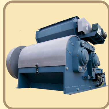
PYXEL HULLER (NEW MODEL)