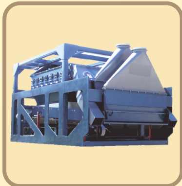
HULL - MEAT BASKET SEPARATOR