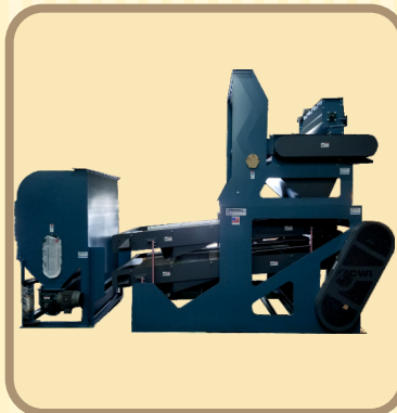
399 NEW SEED CLEANER