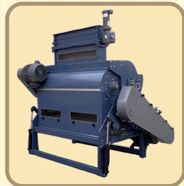
NEW 200 SAW DELINTER