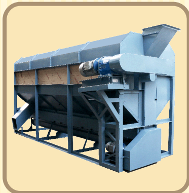
ROTARY BOLL & SAND CLEANER