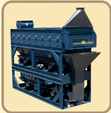
SEVEN STAGE LINT CLEANER